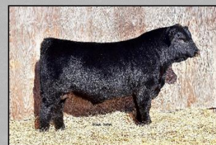
BABR 5201C RELOAD