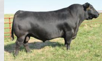
Angus SAV Resource 1441