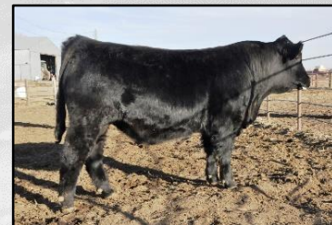
Sire of VLK E748

Branded Man 3400A BA3 Black - Homo Polled