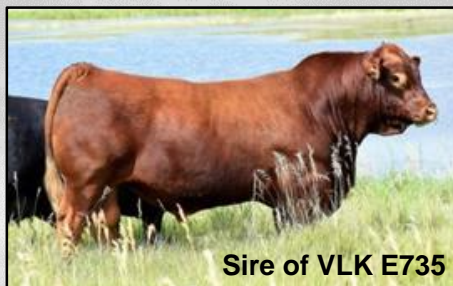
Sire of VLK E735

A BEA 301A Closer son who is a near carbon copy of his sire – need we say more. A higher percentage bull that walks fluently on a big foot. This bull is as soggy as they come and came in with an adjusted weaning weight of 847 (ratio of 106). His maternal grandsire, who came to us from Cranview Gelbvieh, has produced several easy fleshing brood cows.