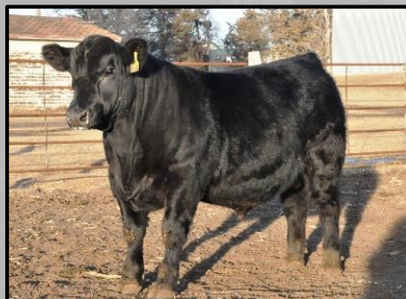
Sire of VLK E701

This BA50 bull sired by BEAS 2806Z is certainly one we like. His style and presence catches your eye every time you walk in the pen. He is performance driven with WW, YW, & CW all within the Top 3% of the breed. Coming from the Quenivere cow family look for this bull to sire deep sided, thick made, structurally correct, functional cattle with a desirable phenotype. Tested homo black and homo polled.