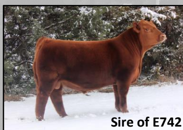
Sire of E742

Red Cloud is a smooth made BA50 sired by the Red Angus bull, Flashback. A moderate framed, stout made bull that is square hipped and deep sided. A complete bull with an athletic build with extra eye appeal. His dam's progeny average 75 lbs on birth weight and nearly 700 pounds on WW. His dam goes back to Red Alert 2077K whose numbers excel in BW and growth. He touts an adjusted weaning weight of 827. Potential calving ease bull. He's one you'll like.