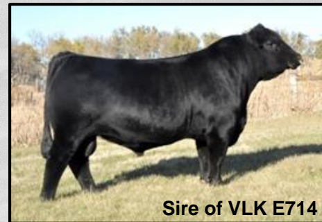
Sire of VLK E714

VLK E714 is a powerhouse, meat-wagon backed by a highly proven cow family. A performance driven bull with good testicles with a lot of mass and volume. This easy fleshing Sledgehammer son will sire an awesome set of replacement or feeder cattle. WW ratio of 113, Top 5% WW, top 10% YW, Top 25% YG, Top 20% CW, Top 20% Feeder Profit Index. Homo black. HD profile EPDs