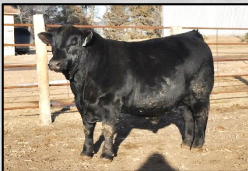
VLK E726 ET